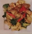
Chicken w. Vegetable