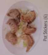
Pot Stickers (6)