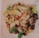
Moo Goo Gai Pan