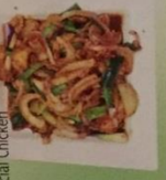
House Special Chicken