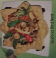
Seafood Bird Nest