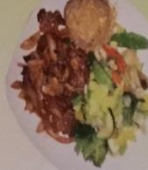
Korean BBQ Beef