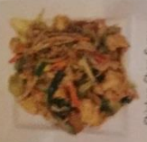
Chicken Chop Suey