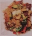
Cantonese Style Chow Mein