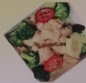
Asian Chicken Salad