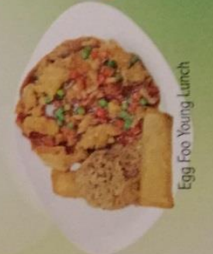
Egg Foo Young Lunch