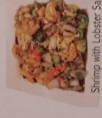
Shrimp with Lobster Sauce