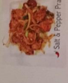
Salt & Pepper Prawn