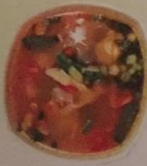
Tom Yahn Gai Chicken Soup