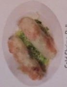
Cold Shrimp Roll