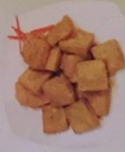
Crispy Silken Tofu