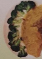
Vietnamese Happy Pancake