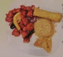
Orange Chicken Lunch