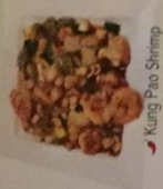
Kung Pao Shrimp