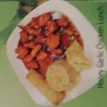
Honey Garlic Chicken Lunch