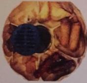
Pu Pu Tray (For 2)