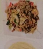
Moo Shu Chicken