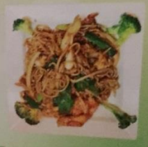
Chicken Lo Mein